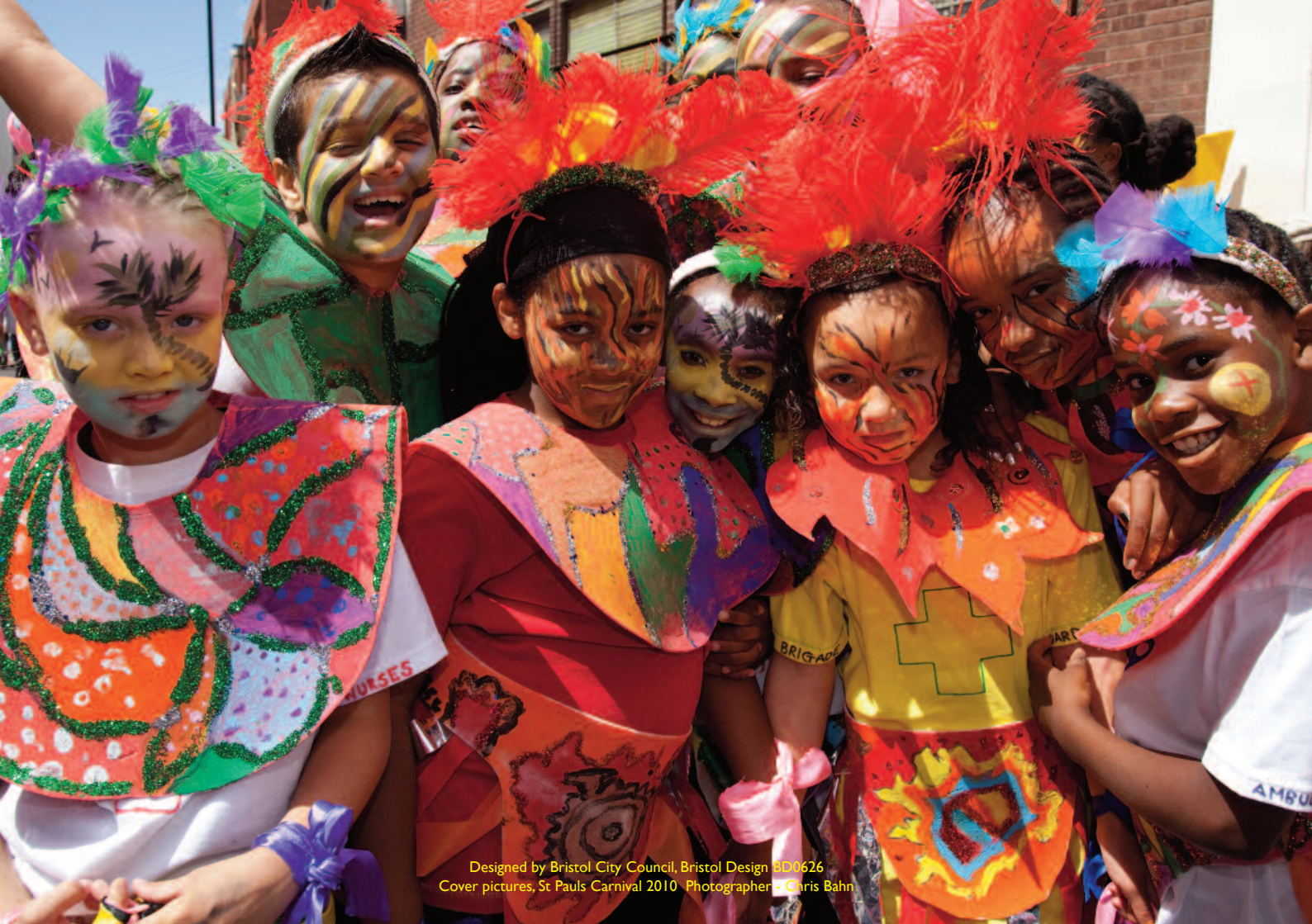
Designed by Bristol City Council, Bristol Design BD0626 Cover pictures, St Pauls Carnival 2010.