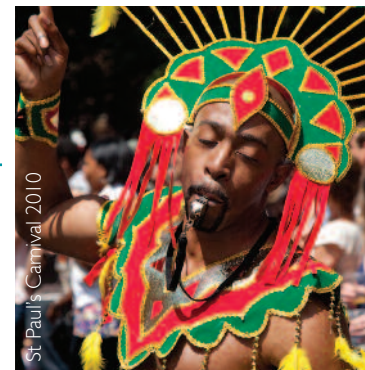
St Paul's Carnival 2010