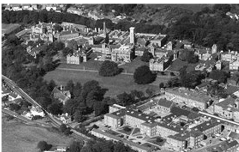
Glenside Hospital, Fishponds, Bristol

When a position as ward sister was advertised, Princess applied. Two nurses were shortlisted. The white, younger, less qualified and less experienced nurse was given the job. This injustice caused much dismay and anger in the hospital and eventually Princess was called to the office and given an apology. They admitted it was unfair and a wrong decision. A few years later, she was promoted and became the first Black ward sister, setting high standards in nursing care until she retired in the 1990s.